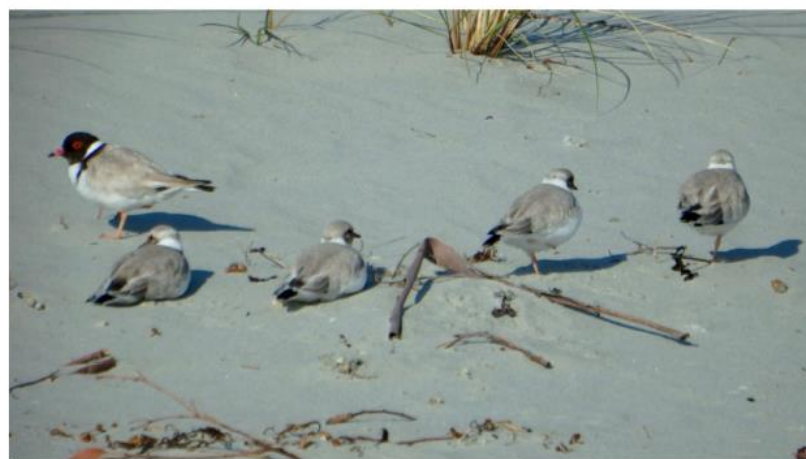
Part of a 'creche' of 7 chicks and two adult Hooded plovers. Adventure Bay beach 2016.

In conjunction with these events volunteers have erected signage and protective fencing at the most vulnerable sites on an annual basis. Seasons have varied in success but we have observed a steady increase in numbers and additional nesting sites being adopted. In recent years, with agreement from Parks, we have erected signage and fencing on Cloudy Bay beach in the South Bruny National Park. This is an exposed and wild beach on the southern edge of Bruny Island and is the only beach on Bruny where vehicles are permitted to drive other than to launch boats. Driving is restricted to those accessing a campground at the end of the beach. It is extremely troubling to observe the increased amount of hooning and number of vehicles driving and parking along the beach. BIEN is planning action on this over this season and intensifying the volunteer effort, signage and fencing. For the first time we are also using shelters which have been built for us by the Bruny Mens Shed. In March this year a team from Birdlife Australia and Deakin University undertook the first tagging of Hooded Plovers on Bruny as part of a Tasmania wide research project. For us this will enable an additional understanding of the territorial and pairing behaviour of the birds we think we know so well!