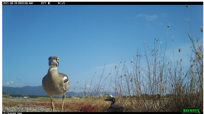
"Security Gate": A Beach Stone-curlew incubates while its mate keeps guard at their nest just off the runway at Cairns Airport.

These two nests in industrial settings demonstrate how tenacious Beach Stone-curlews can be, sticking to their regular nest sites despite disturbance. It seems that some types of disturbance, such as planes going overhead, or vehicles coming and going, can be tolerated. Beach Stone-curlews likely experience these type of 'background' disturbances very differently than direct disturbance such as being chased by a dog or displaced by a quad bike.