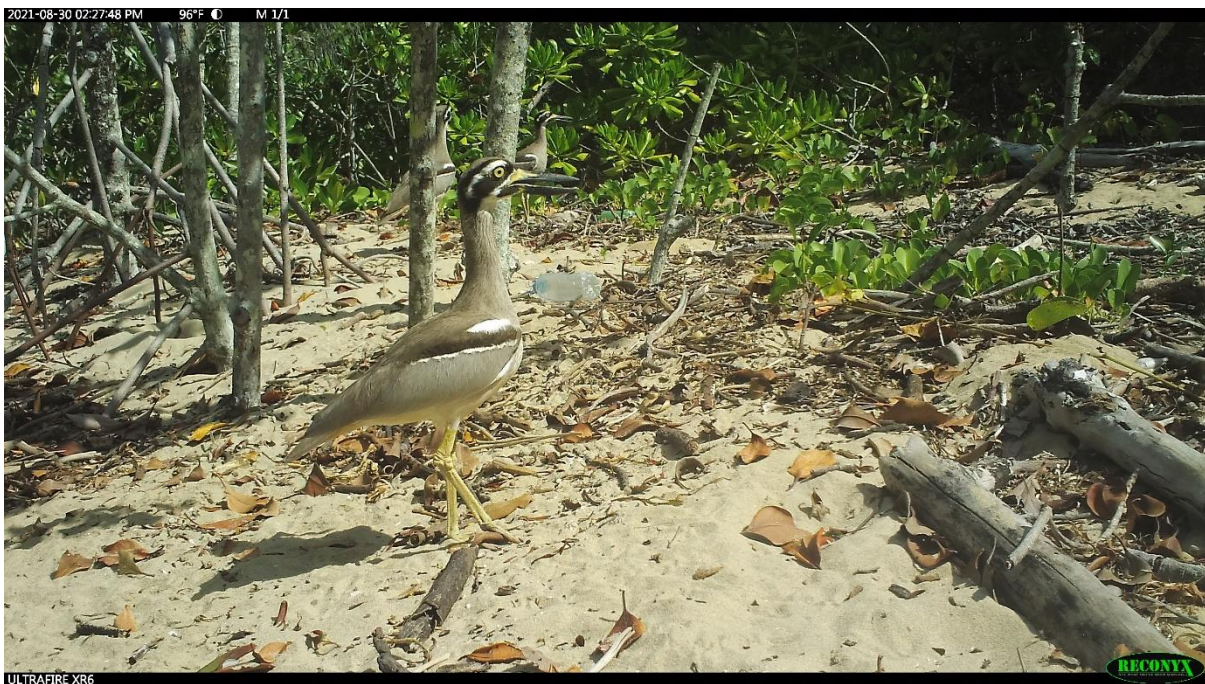
"Standing Guard": A Beach Stone-curlew pair and, we presume, their adult offspring, keep watch at their nest on the coast near Cairns. Their rudimentary nest with one egg is out of view behind the bird in the foreground.

To date we've seen one successful hatching with the young chick being moved under cover soon after. Other video footage is still being analysed but we're hopeful that more eggs have made it to hatching too.